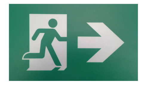
Running Man with Arrow Double-sided to point left or right