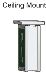
Mount Canopy to Junction Box in Ceiling Using Centre Holes