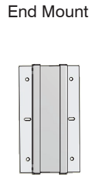
Mount Canopy to Junction Box in Wall Using Centre Holes