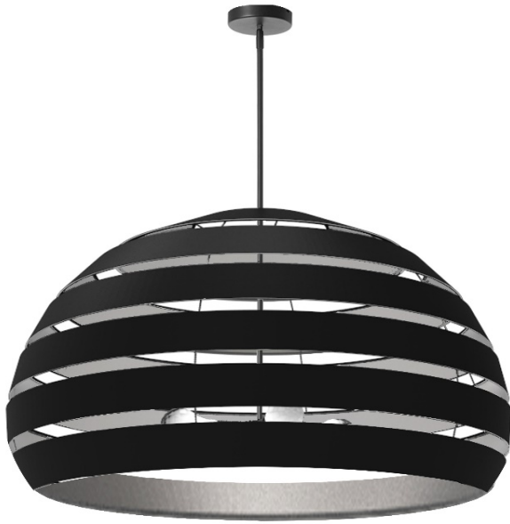
4 Light Matte Black Chandelier w/ Black/Silver Shade

Height 23 Width/Length 36 Depth 36 Weight 25