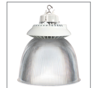
70° polycarbonate reflector