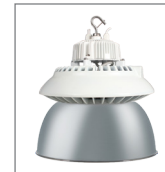
90° aluminum reflector