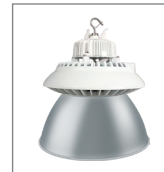
60° aluminum reflector