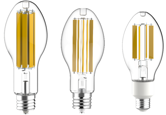
45W EX39 BASE