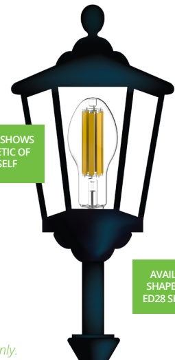
Fixtures for illustration only.