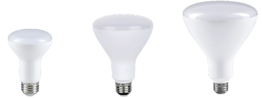
BR20 6W BR30 7.5W BR40 13W