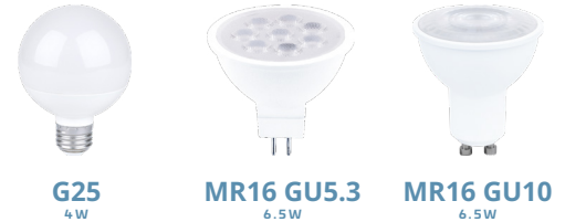
G25 4W MR16 GU5.3 6.5W MR16 GU10 6.5W