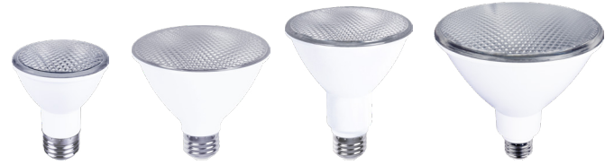
PAR20 6.5W PAR30 10W (SHORT NECK) PAR30 10W (LONG NECK) PAR38 14W