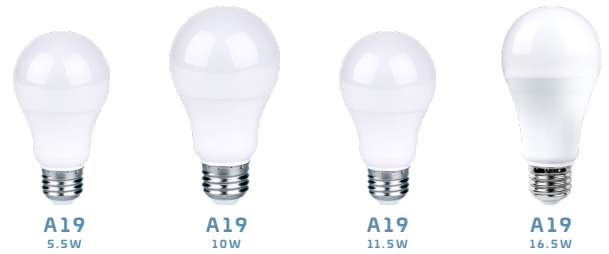
A19 5.5W A19 10W A19 11.5W A19 16.5W