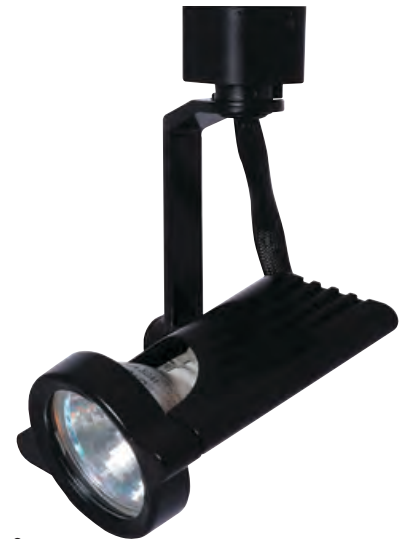
ETS508- MR11 Mini Deco 2