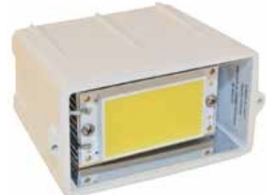
Shown installed in Back Box (Driver behind LED)