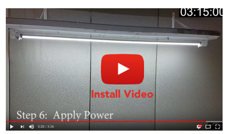
Watch Installation Video: goo.gl/CFZ4wu