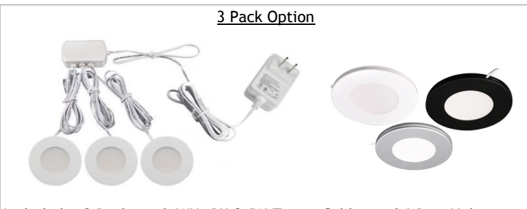
Surface Mount Bracket

Included: 3 Pucks with WH, BK & BN Trims, Cables and 6 Port Hub Plug-in Driver 120VAC 12W Non Dimmable