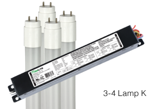
3-4 Lamp Kit