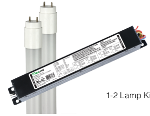
1-2 Lamp Kit