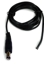
NATL-10 / NATL-30 Power Line Connector (10' included)

24V Constant Voltage Dimmable Hardwire Electronic Driver