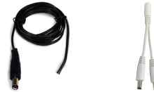
Power Line Connector

NATL-422B Black NATL-422W White Field-cutable plastic. Includes wire channel with double faced tape and cover.