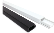
2' Wire Raceway

NMPKA-RECBZ Bronze NMPKA-RECC Chrome NMPKA-RECW White Used to mount puck light recessed and flush