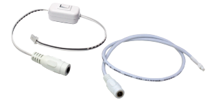
Power Line Interconnector

NAPK-713B Black NAPK-713W White Used to connect two interconnection cables together or to add interconnection cable to power line interconnector. Dim.: 3/8" W; 3/4" L; 1/4" H