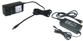
Direct Plug-In LED Driver

NATL-415W Use to join low voltage lead to low voltage power line connector or interconnector.