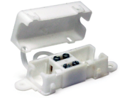
Low Voltage Splice Box

NALTL-10 10' Cable NALTL-30 30' Cable For use with Class II drivers. Carries output from driver, requires power line cable. 5" Power Line Splitter NATL-302W