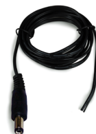
NALTL-10 / NALTL-30 Power Line Connector