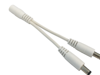
NATL-302W Power Line Splitter