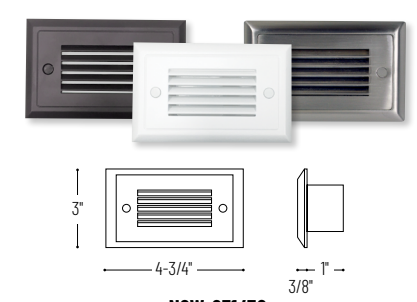
NSW-671/30 Horizontal Louver