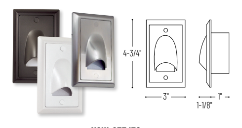
NSW-675/30 Vertical Shroud

Example: NSW-673/30W - Mia LED Step Light, Horizontal Shroud (Non-Dimmable), 3000K, White finish