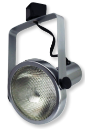
NTH-108N Natural Metal Rear Loading Gimbal