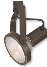
NTH-108BZ Bronze Rear Loading Gimbal