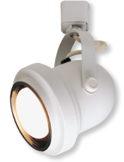
NTH-110W White Classic Cylinder with Black Baffle