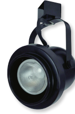
NTH-110B Black Classic Cylinder with Black Baffle