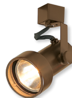
NTH-122BZ Bronze Designer Step Cylinder