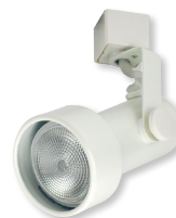
NTH-122W White Designer Step Cylinder