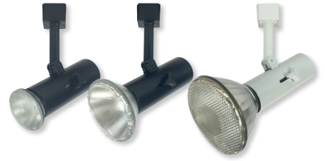
shown with PAR20