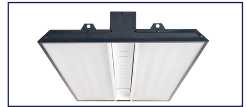
Lens, Frosted Acrylic (LF)