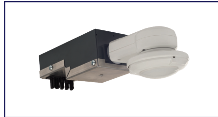
End Mounted Full Dimming Sensor (OEMS1360P-DG)