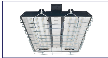
Fixture Wireguard (LED-HBIF-WG01-KIT-SP)