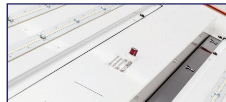
Battery Back Up (FWBB)