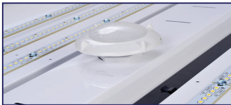
Integrated Sensor (WSXX)