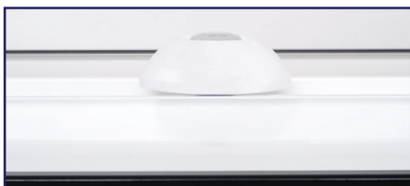
Enlighted Integrated Sensor (-EN)