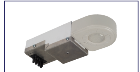
End Mounted Non Dimming Sensor (OEMS1300P-WH)