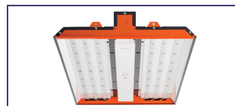
Orange End Caps (OE)