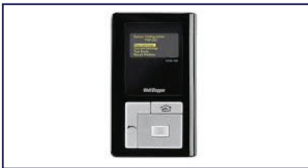
Sensor Configuration Tool (FSIR-100)