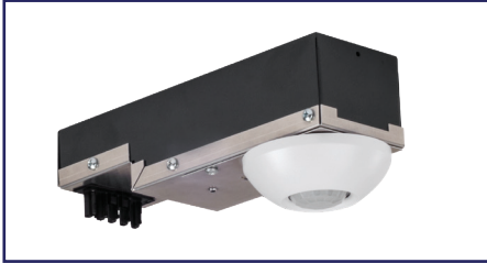
End Mounted Network Control (See Hyperlink for Order Logic in Field Accessories Table)