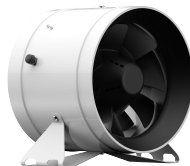
5"/6"/8"/10"/12" Mixed flow inline fans ODDMF-5-166 ODDMF-6-350 ODDMF-8-710 ODDMF-10-1065 ODDMF-12-1750