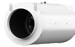
6"/8"/10"/12" Mixed flow Silencers ODDMF-6-350-Q ODDMF-8-710-Q ODDMF-10-1065-Q ODDMF-12-1750-Q