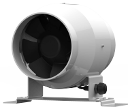
4" Mixed flow inline fan ODDMF-4-160