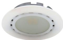
PUK SLIM WH (White)