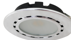
PUK SLIM SN (Satin Nickel)