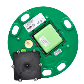
Internal user-replaceable battery in sealed battery compartment