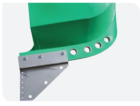
Stainless steel keel ensures buoy remains stable in faster water currents