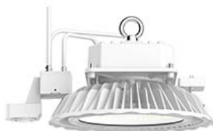
S1/S2 Factory Installed Sensor